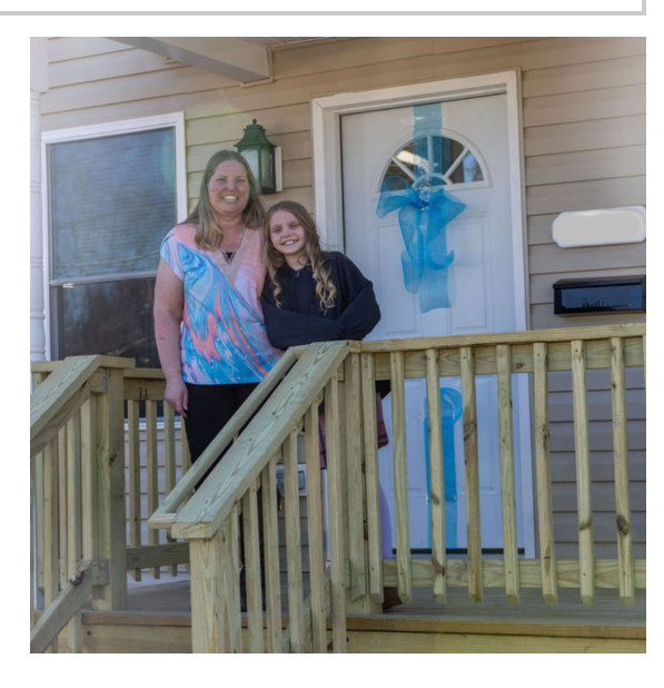
Check out our <u>Facebook photo album</u> for pictures of the home dedication ceremony taken by <u>Laura Ames Photography</u>.

To learn more about our <u>Homeownership Program</u> and how to