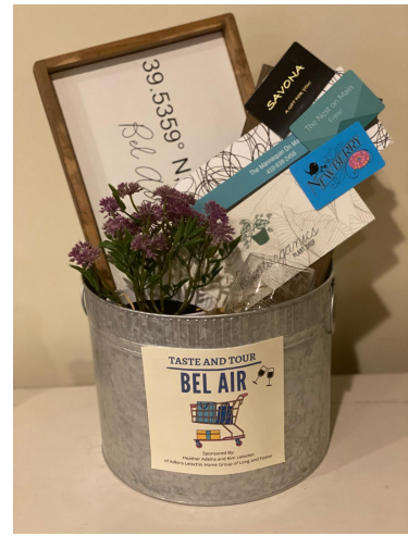
TASTE & TOUR BEL AIR #2