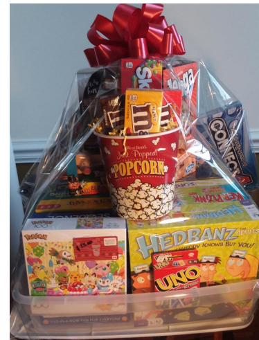
FAMILY GAME NIGHT