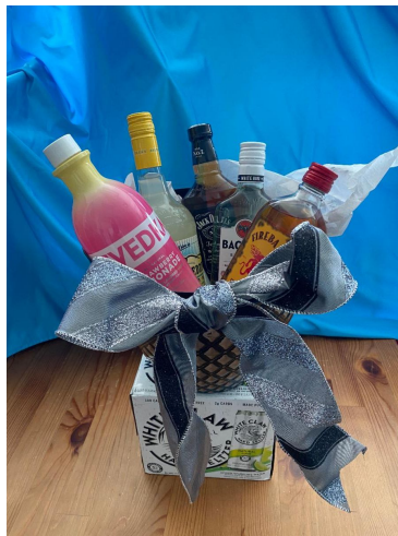
BASKET OF CHEER