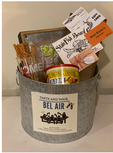
TASTE & TOUR BEL AIR #1