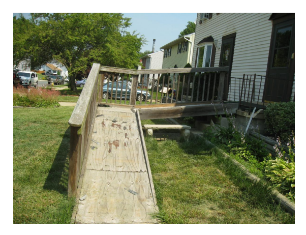
"Before" picture of ramp at the home of someone who requested our Repair Program's assistance.

Whether you follow our campaign by putting aside pocket change each of the 40 days of Lent or simply want to show gratitude for your home, help us help lowincome neighbors with their critical home repairs! Our Repair Program works on roofs; ramps; flooring, electrical & plumbing issues; accessibility needs/mods, etc. Please visit our <u>website</u> for details. Our Lent Build fundraiser ends this month.