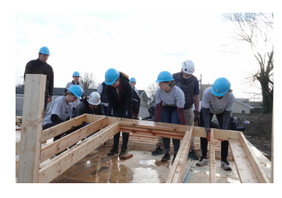
Gustavus Adolphus College