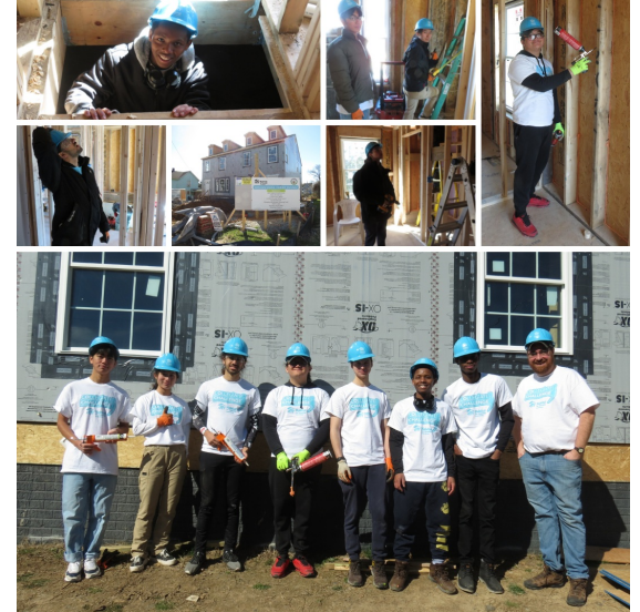
Want to hear more about the Colgate University Collegiate Challenge team's experience with us? Visit our <u>Facebook</u> page and watch our two-minute video!