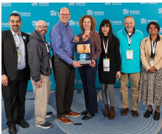
Pictured: CEO of Habitat for Humanity International,