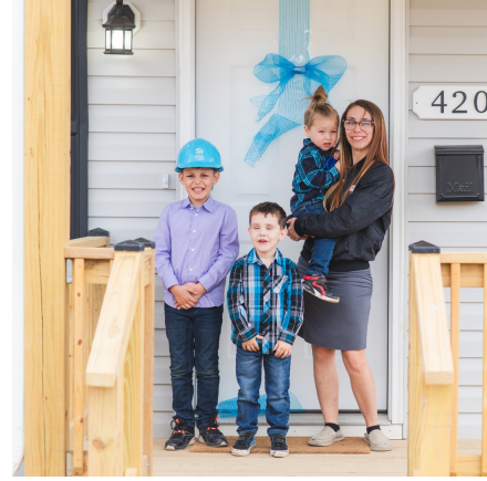
View the dedication photo album on our Facebook page .

For more information, read our press release .