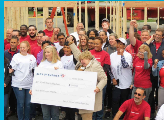
Bank of America panel build

Vision: Create a community where everyone has an affordable and decent place to live.