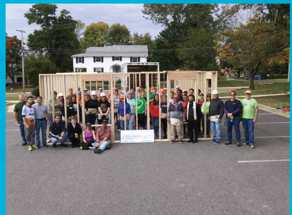
Saint Margaret Parish panel build