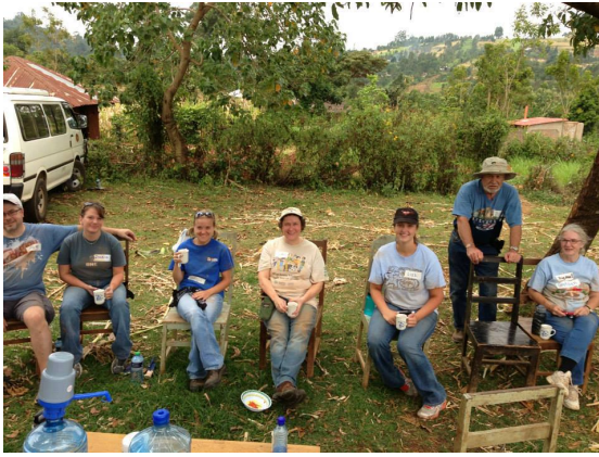
Bottom photo: "Crazy Build"