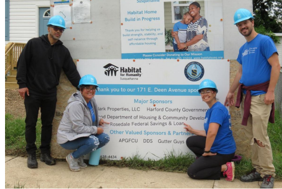
Pictured: Employees from Rosedale Federal Savings & Loan recently participated in a sponsored Team Build Day at our build site on Deen Avenue, Aberdeen. Rosedale Federal has been a longtime supporter and sponsor of Habitat Susquehanna's mission. Visit our website for sponsorship levels.

These build days promote friendship, teamwork and volunteerism with your group, and are a rewarding and impactful way to partner with us in support of our local communities.