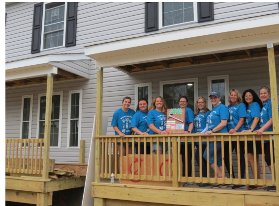
Janney MACWIN team: Winning fundraising team for Women Build 2023 (holding "tacky hammer" award)