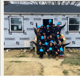
CAL STATE SAN MARCOS