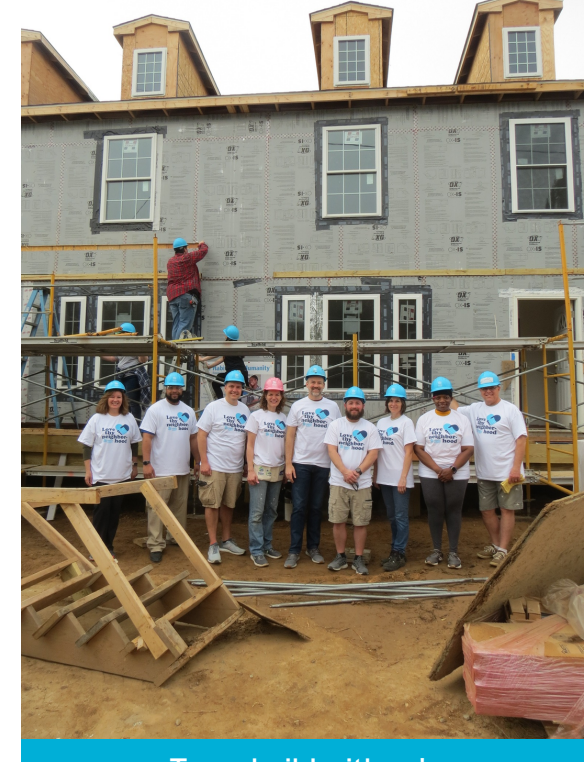
$<u>4,000 ROOM WITH A VIEW</u>- This level of sponsorship equates to the cost of purchasing and install energy efficient windows to light up, weatherize, and beautify a Habitat home.

The typical Team Build Day is from 9am-3pm (timing can be flexible) on location at one of our active build sites and includes lunch and t-shirts. There are additional Team Build opportunities, such as our annual Women Build event, that include other perks and may be of interest to your group – ask us about them!