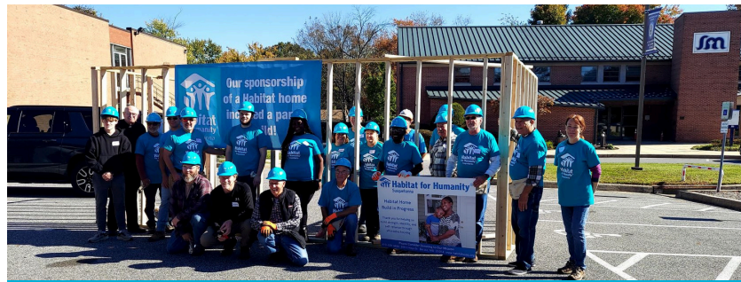
St. Margaret Parish Hammers Up Build Day

900 local individuals have been served through our free financial literacy program