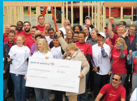
Bank of America panel build

Vision: Create a community where everyone has an affordable and decent place to live.