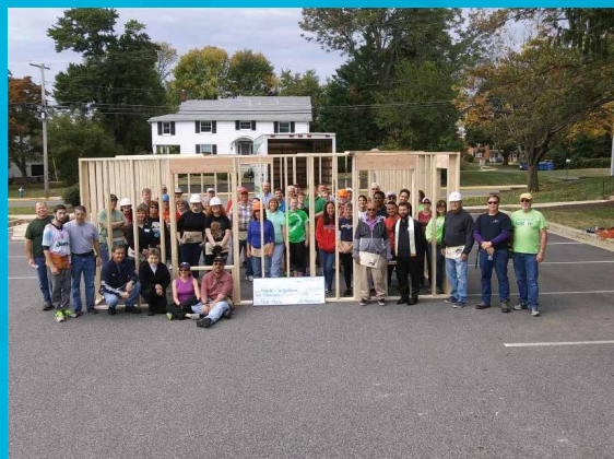
Saint Margaret Parish panel build