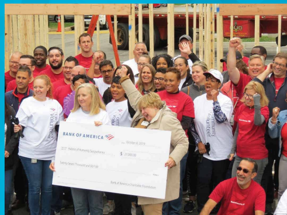
Bank of America panel build

Vision: Create a community where everyone has an affordable and decent place to live.