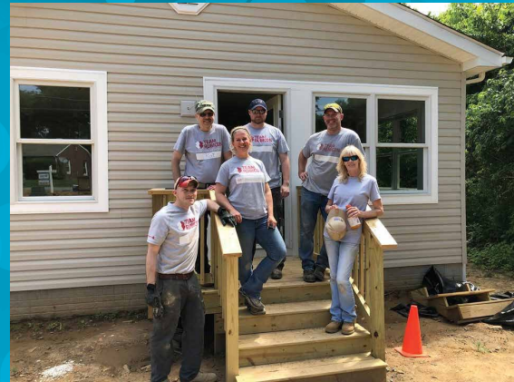
Team Rubicon at Perryville house build