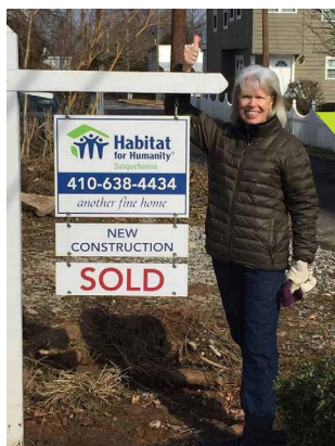
Kathryn Freedom Lane, Havre de Grace

New construction added $489,345 to the economies of Havre de Grace and Perryville by building three new homes. In 2020, our homeowners saved approximately $599,175 with an affordable mortgage versus market rent, and they earned $875,476 in home equity. Our financial literacy program served an additional 88 families.